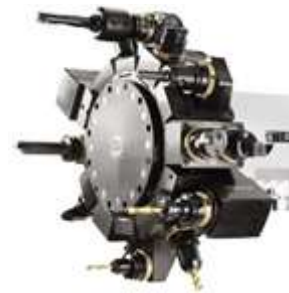
T8MS HIGH SPEED, HEAVY-DUTY Turret